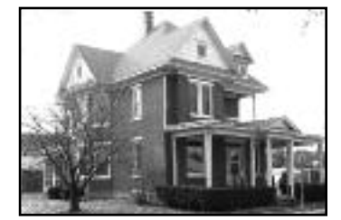
The Rodgers Home • 89 Chestnut St.