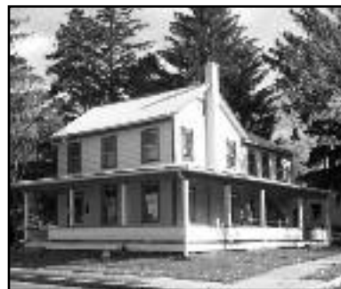
Volunteers have painted the exterior of the Weirick House at 5th and Green sts. The Weirick House is part of the Historic Elias Church project. The house will become a gift shop, small bistro restaurant, public restrooms and overnight accomodations for actors when the church becomes a playhouse. ❁