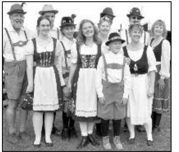
Black Run Bohemian Dancers

Mifflinburg's 4th annual German Oktoberfest is Fri., Oct. 2 (3-10pm) and Sat. Oct. 3 (from 11am-10pm). Oktoberfest takes place on the VFW carnival grounds, just west of Mifflinburg on Route 45—Under the Big Tent—rain or shine! This great family event celebrates Mifflinburg's German heritage. The Oktoberfest committee and the Mifflinburg Heritage and Revitalization Association (MHRA), the sponsoring organization, works hard to make this two day event mirror the great Oktoberfest of Munich Germany.